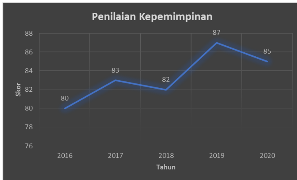
Figure 1 Metro City Trade Office Leaders Scoring

A decrease in the quality of leadership and a decrease in work motivation has resulted in a decrease in the performance of ASNs at the City of Metro Trade Service. These two variables are thought to be the reason for decreased performance following research conducted by Syafii et al (2015), Guteressa et al (2020), Susanto et al (2020), and Laksmana and Riana (2020). The four studies have one conclusion in common, that is, work motivation possessed by employees has a significant mediating role in the influence of leadership on employee performance. Based on the description of the background and the identification of the problem, this research was conducted to analyze the role of mediating work motivation in the positive and significant influence of leadership style on the performance of the employees of the Metro City Trade Office.