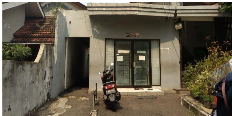
Figure 1. BMT Nasuha Office

(6) Physical Evidence: The building of BMT Nasuha is not optimal, but the physical building of BMT Nasuha is effective in supporting the provision of services to members and prospective members. (7) Process: The process of running savings product activities from BMT Nasuha is to provide information to prospective members through activities held by BMT Nasuha, as well as provide an explanation of the process of becoming a member. By providing a clear explanation of the membership process, prospective members are not confused about saving using savings products at BMT Nasuha.