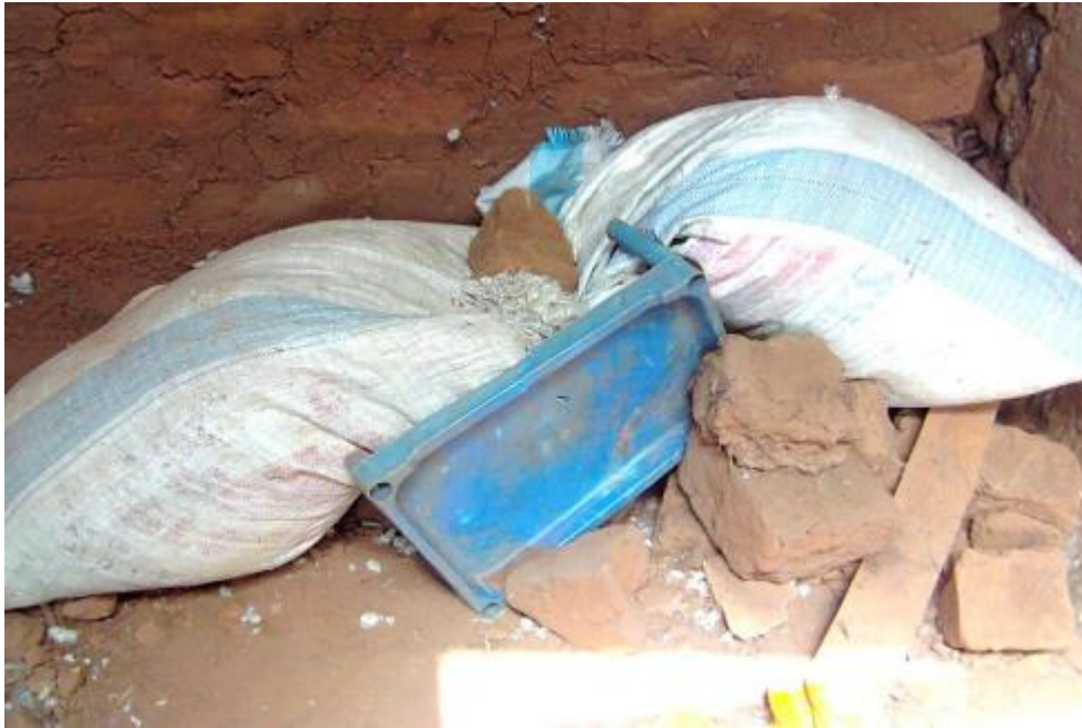
Plate 2: Foodstuffs Covered to Prevent Damage by Monkeys