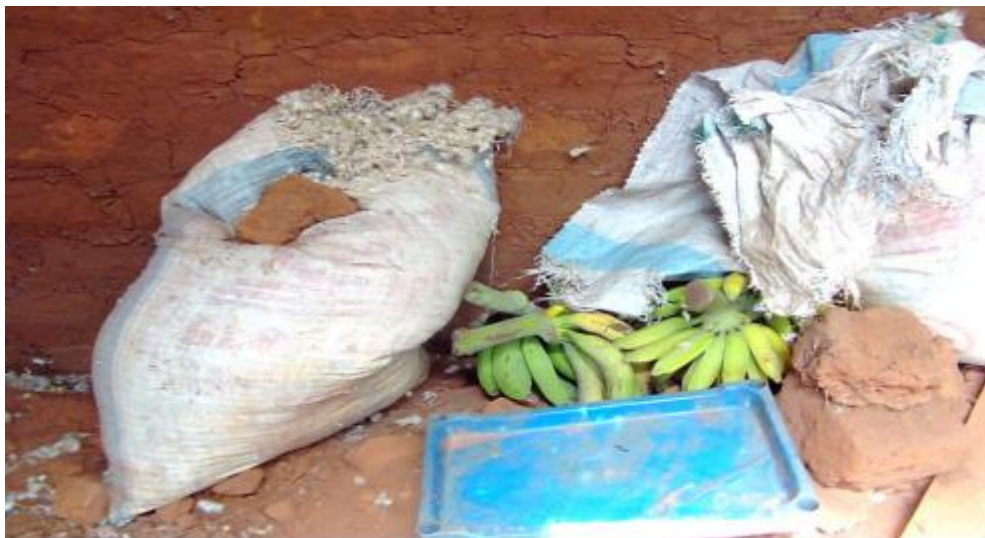
Plate 1: Foodstuffs to Be Covered to Avoid Monkey-Damage

N = 302; N < 404, because of non-response